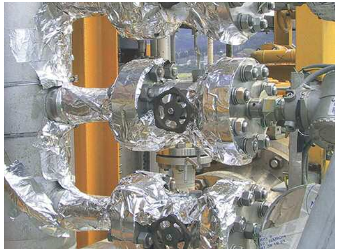
Coverage of tracing with insulation