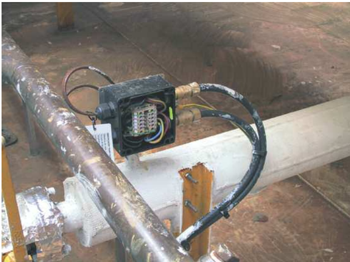
Junction box to control tracing